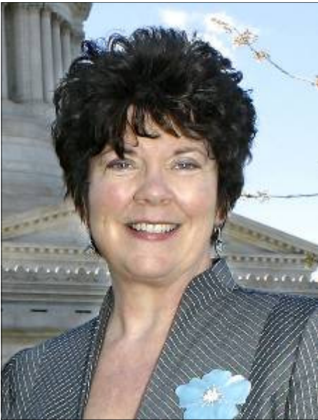
Senator Pam Roach

Includes a portion of the Auburn School District